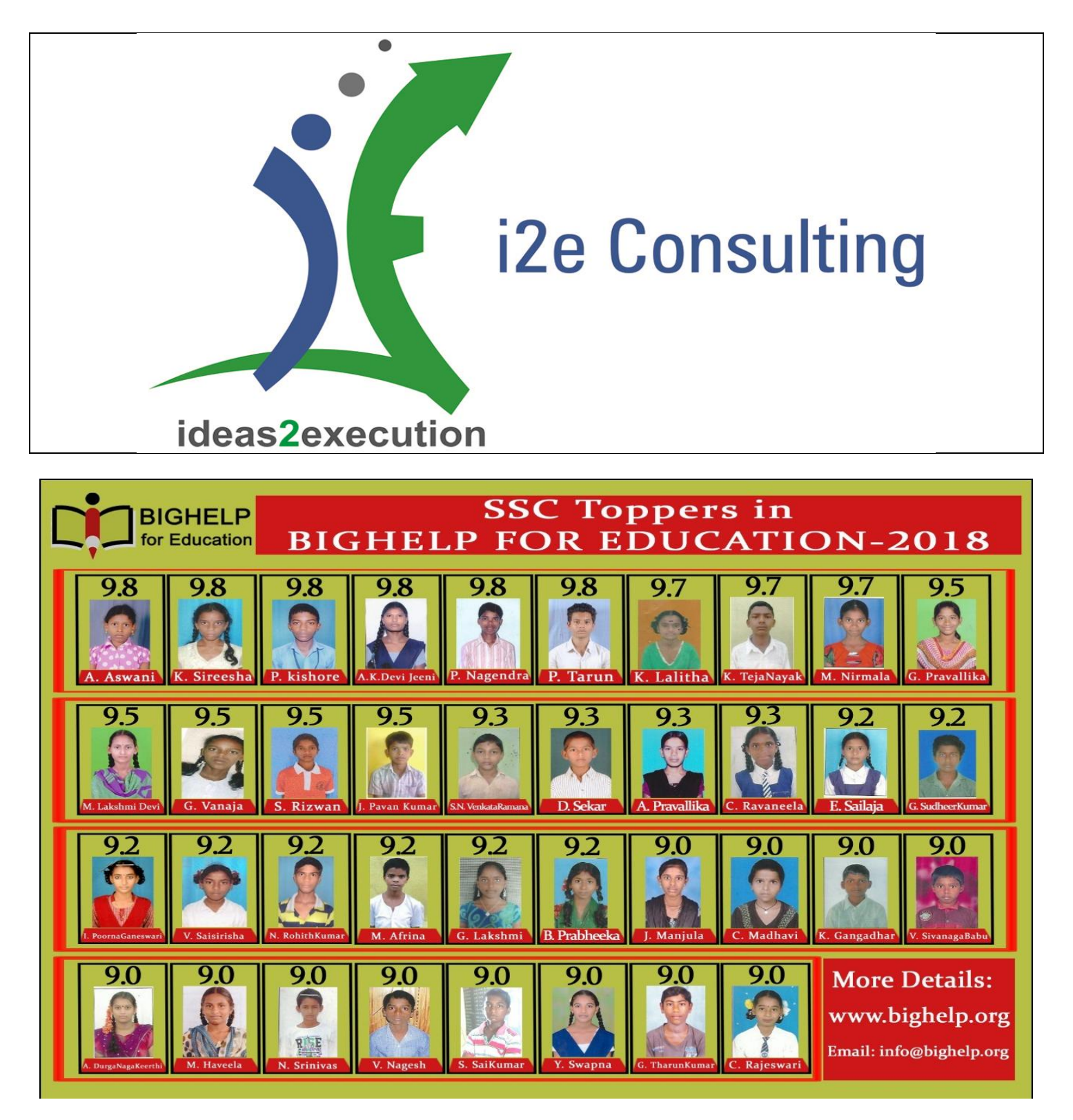
Congratulations to all SSC toppers in 2018 for your winning streak! It will be a long journey, but Bighelp knows that you will be successful! Dream for it and go for it!! Bighelp is with you to help pursue your dreams!