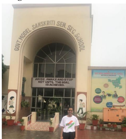
Entrance of the school

I held a two-day workshop at the Government Model Sanskriti Secondary School located in Sector 20 Panchkula, Haryana. Students from grades 1 to grade 12 must perform well to get admission into Sanskriti School. The school consists of 1200 students with 45 teachers in total. Most of the students come from underprivileged households. The students, who cannot afford many of the costs associated with attending school, are given free books, pencils, pens, meals and uniforms. The teachers of the school are very dedicated towards providing good education to these students. The school is not very big, but all the classrooms are surrounded by a garden. The garden is fully planted with trees and plants which creates a healthy environment for the students. The school has one computer lab with a TV and a few computers all thanks to NGO's who donate such resources which can help the students learn how to code and generally use the computer. These give enhanced educational facilities to these students. The Big Help organization arranged my internship at the Sanskriti School. I had come to Chandigarh, India for my summer vacations hence I decided to utilize my vacations effectively by volunteering at Sanskriti School through the Big Help for education organization .